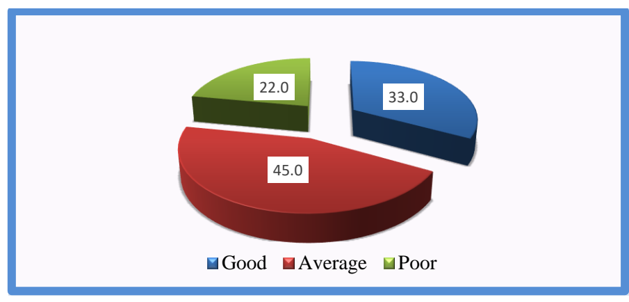
Figure (2): Percentage distribution of studied patients regarding their total knowledge level about cardiac stent (n=100).