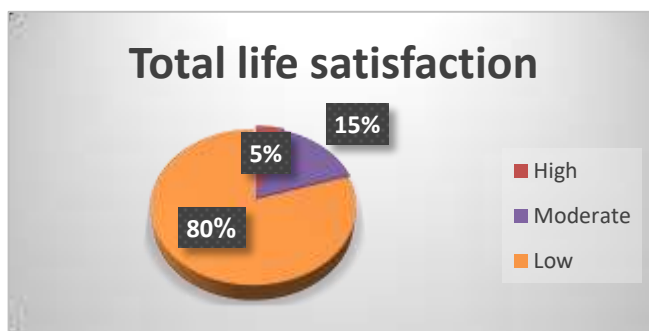
Figure (2): Distribution of the studied patients according to their total level of life satisfaction (n=100).